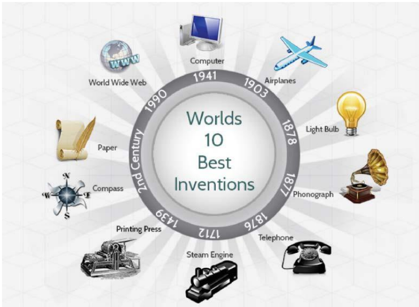
The World's Best 10 Inventions, http://visual.ly/worlds-ten-best-inventions-all-times